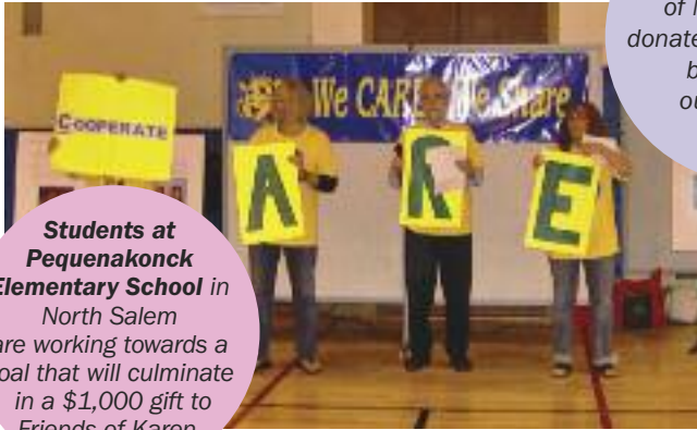
Students at Pequenakonck Elementary School in North Salem are working towards a goal that will culminate in a $1,000 gift to Friends of Karen.