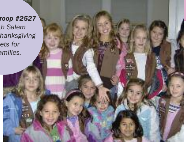
Brownie Troop #2527 of North Salem donated Thanksgiving baskets for our families.