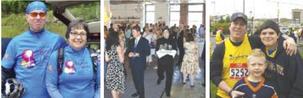
Scenes from last year's Journey of the Heart, Evening at Tribeca Rooftop and Walk/Run for FOK at the LI Marathon

For a fun and exciting way to get some exercise while raising funds for Friends of Karen, join the Walk/Run at Eisenhower Park in East Meadow, New York.